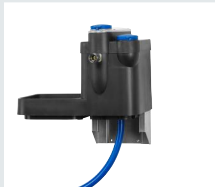
External Water Break Tank for up to 40 ltr/min.