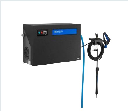
Accessory storage kit, for lances, hose, gun and foam sprayer