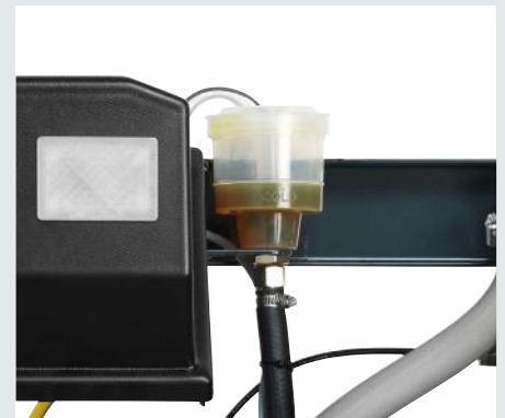
Pump oil tank with oil level sight and fill/empty function