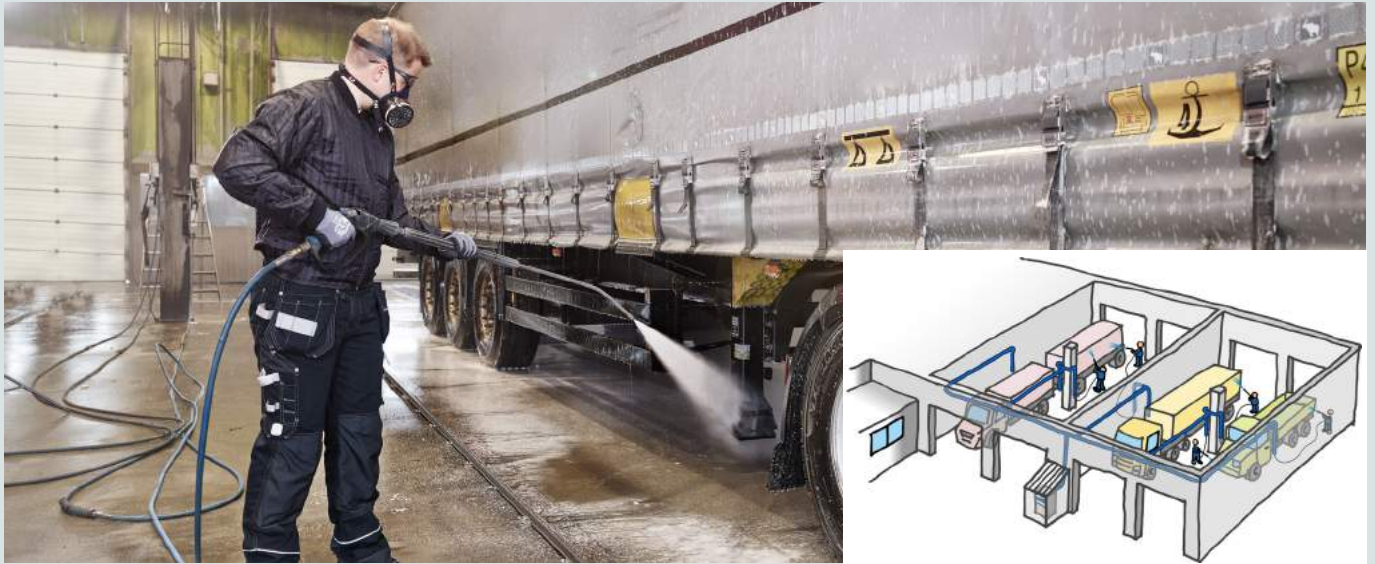
Large trucks wash area. Main applications being truck wash, pre-wash & cleaning of hard to reach areas as well as cleaning the inside of trailers. This company has 4 wash bays with up to 6 operators working simultaneously