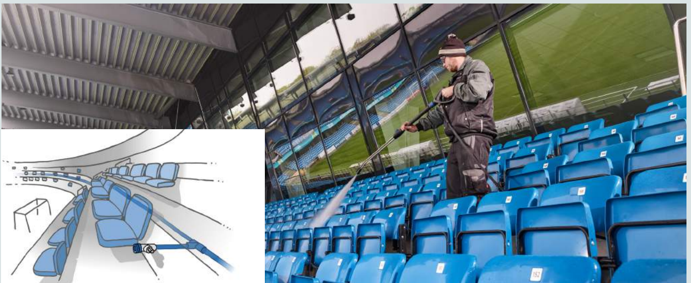
Cleaning of spectator area and seats in a stadium. Cleaning the spectator area after a game or an event can be difficult. In this example the stationary high pressure washer system (SC DELTA) enables multiple operators to clean fast and efficiently at the same time