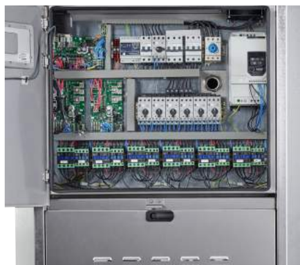
Convenient: Advanced pump management system with start/stop control