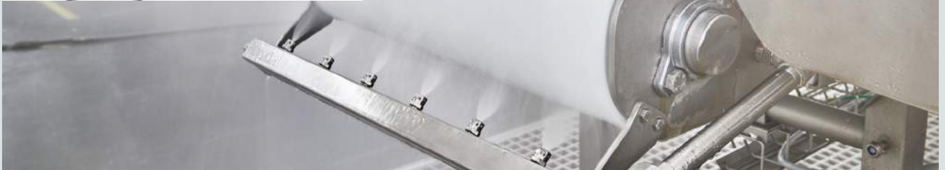
Conveyor belt cleaning in a large slaughter house. In this application the SC DELTA is fed with hot water needed together with high flow and pressure to achieve the desired result. SC DELTA enables several belts being cleaned at the same time