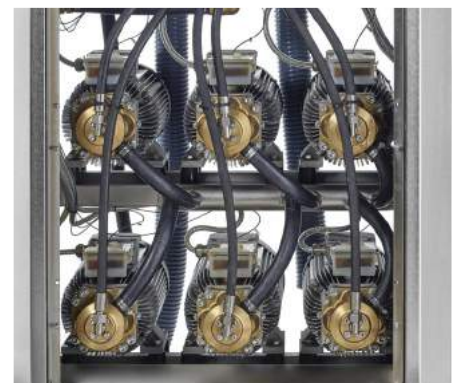
Easy service and maintenance: Time-saving access to motor pumps and other vital parts from top or front of the machine